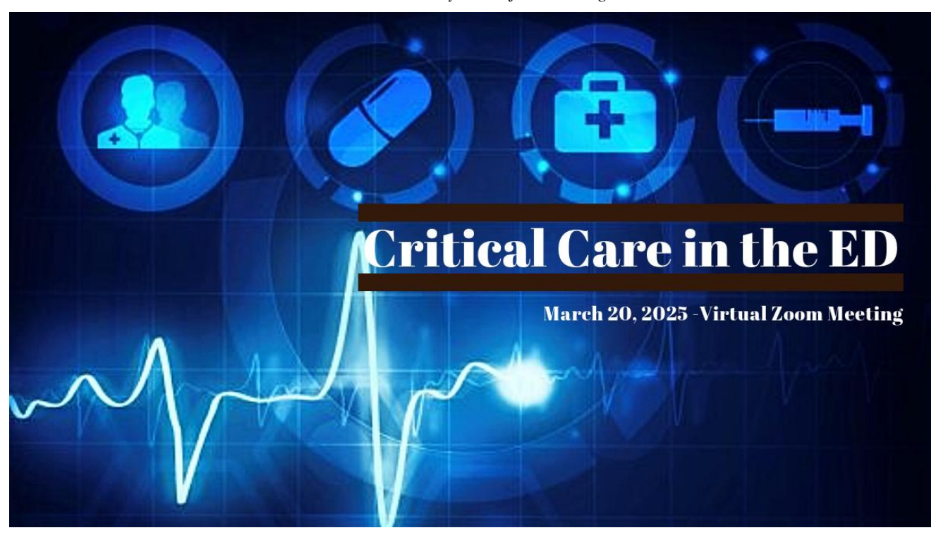
Schedule may be subject to change.